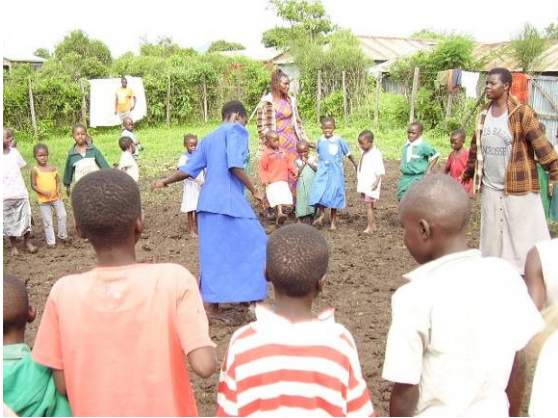
Learning through play

Education: Education provides a firm foundation for children and contributes towards human development. In the rural areas, education is probably the only opportunity that ensures a better future for children.