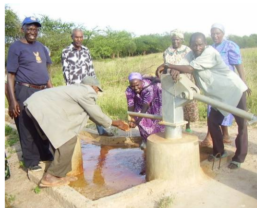
Clean water available