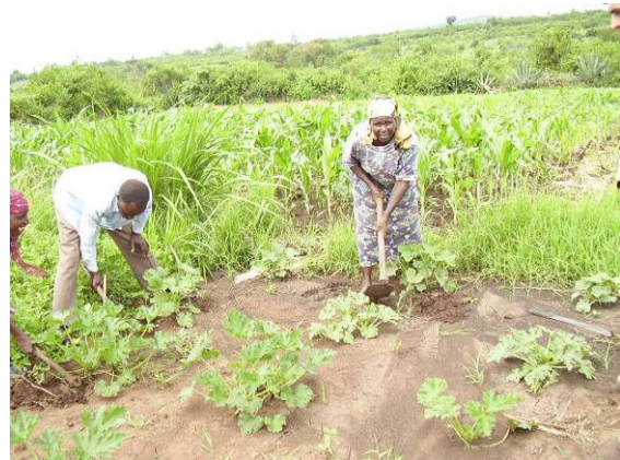
Improved farming practices

Improved farming practices are a challenge, owing to high cost of tools and equipment. As a result, farmers continue using inappropriate farming tools resulting to low harvests.