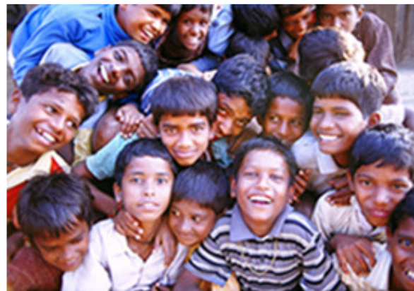
Our name is Today

Over the next five years Plan together with its partners, aims to reach out to some of the poorest areas of the country, in the states of Bihar, Madhya Pradesh, Orissa, Rajasthan, Uttarakhand, Uttar Pradesh, Jharkhand and Chhattisgarh (marked in blue on the map). Plan will gradually move out of the Southern states, Andhra Pradesh, Karnataka, Maharashtra and Tamilnadu, where it has been working for many years and which show improved health, education, and overall standard of living.