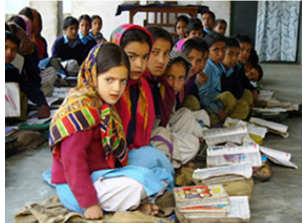
Education – the road to empowerment

All Children should have Quality Education: Plan works closely with communities, children, parents, teachers and local government to improve the quality of education, to make the schools child friendly and to ensure school attendance. Parents are motivated to continue education of their daughters.