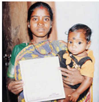
Now, my son has an identity - A birth certificate

Child centered programmes with participation of children: Plan believes in child centered community development. Through its programmes, Plan along with its partner organisations strives to empower children, families and communities so that children's rights are recognized and issues affecting them are amongst the wider agenda of adults, civil societies and the government.