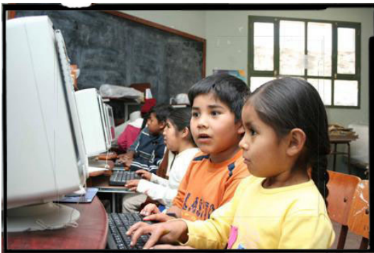
Children deserve quality education