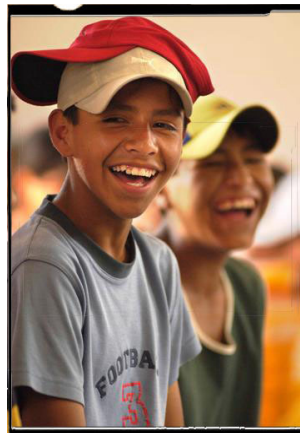
Improving our self-esteem and capacity to decide about our lives

These favour students' organizations and school-making processes related to quality learning; and reinforce the management capacities of municipal governments and educational districts.