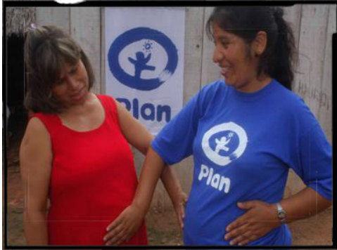
We love our children and are taught how to take care of them even before they are born

Through this program Plan implements neonatal, infant and maternal health involvement and home-based and center-based early childhood care and development which contribute to improve child survival, development and growth, and their mothers improve their quality of life.