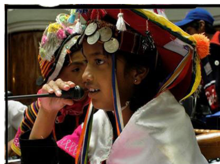
Children have the right to make decisions “We want our voice to be heard”

The program implements interventions to build democratic communities and municipalities which will operate with the participation of traditionally excluded groups (boys, girls, adolescents, women, and men of rural communities). It also strengthens organized groups of children, adolescents, youth and women for the exercise of their rights, improving their participation in alliances and networks promoting their agenda.